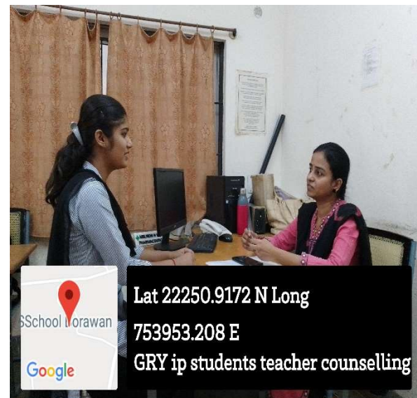
Pic: TG- student and TPO- Student